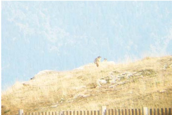
Alpine Marmot Marmota marmota – Two at Pllan de la Ingllada on the 13th (x20).