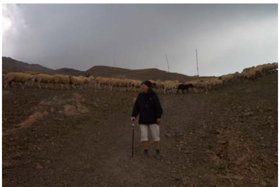
Domestic Sheep Ovis aries – Flock of 2,000 at Cerler Ski Station on the 13th (x1).