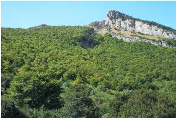
Lammergeier Gypaetus barbatus – Two adults in cliff seen from PR – HU 91 on the 11th (x1)