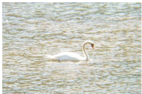
Mute Swan Cygnus olor – One of the two adults at Embalse de Eriste on the 12th (x20)