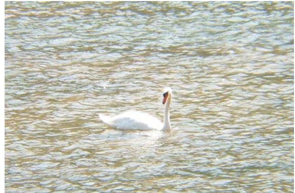
Mute Swan Cygnus olor – One of the two adults at Embalse de Eriste on the 12th (x20)