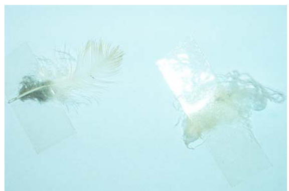
Ptarmigan Lagopus mutus – One feather and some down found above El Gallinero Telesilla on the 13th (x1).