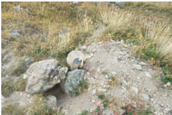
Alpine Marmot Marmota marmota – Between Ampriu and Colladeta on the 13th (x2).