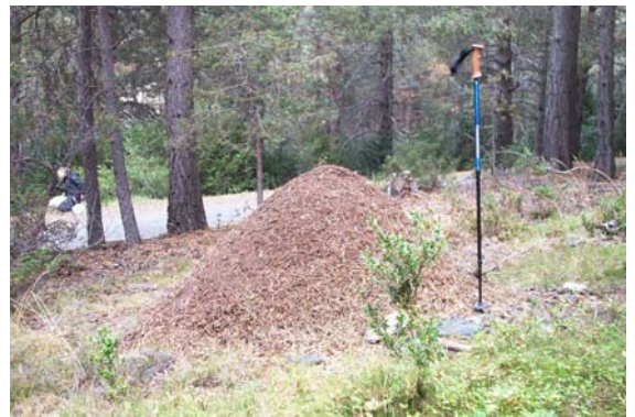
Huge ant nest at NW Valle de Vallibierna on the 14th (x1).