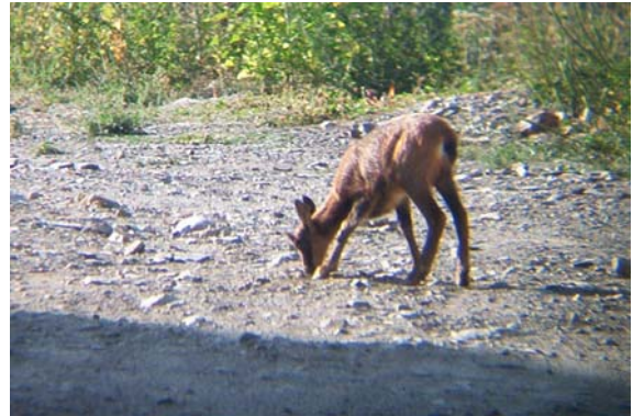
Chamois Rupicapra rupicapra – Young in SE Valle de Estós on the 14th (x20).